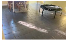
KITCHEN IN DANGER OF FLOODING BECAUSE PIPE BURST UNDER OCEAN