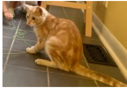
FUZZY NEW KITTY! CAT BATTLES BARON VON STRING AND COUNT YARN