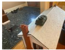
ETH DOLLHOUSE ARRIVES IN HALLWAY